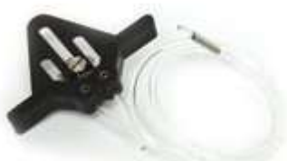
Lanyard for Manual Locking Knee